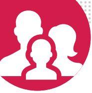
Table of Duties